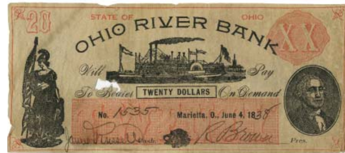
Ohio River Bank. Counterfeit note, 1838. Bequest of Helen Beitler.

Although the rogues' gallery of gray- and black-market operators presented in this exhibition were excoriated by prominent businessmen, reformers, and authorities of the time, they often had intimate ties to legitimate commerce and enjoyed the patronage of these very critics. Ultimately, illegal forms of commerce were integral to the success of the larger American economy and continue in varied forms today.