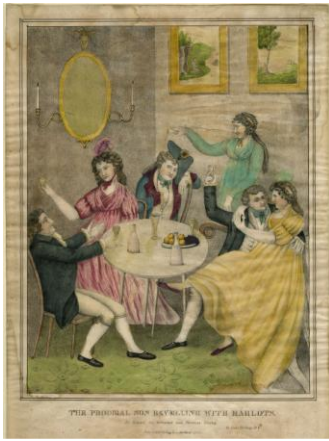
The Prodigal Son Revelling with Harlots. Hartford: D. W. Kellogg & Co., 1838.

Company is to preserve, interpret, make available, and augment the valuable materials within our care. We serve a diverse constituency throughout Philadelphia and the nation, offering comprehensive reader services, an internationally renowned fellowship program, an online public access catalog, and regular exhibitions and public programs. Located at 1314 Locust Street, Philadelphia the Library Company is open to the public free of charge from 9:00 a.m. to 4:45 p.m. Monday through Friday. The Library Company can be found online at www.librarycompany.org .