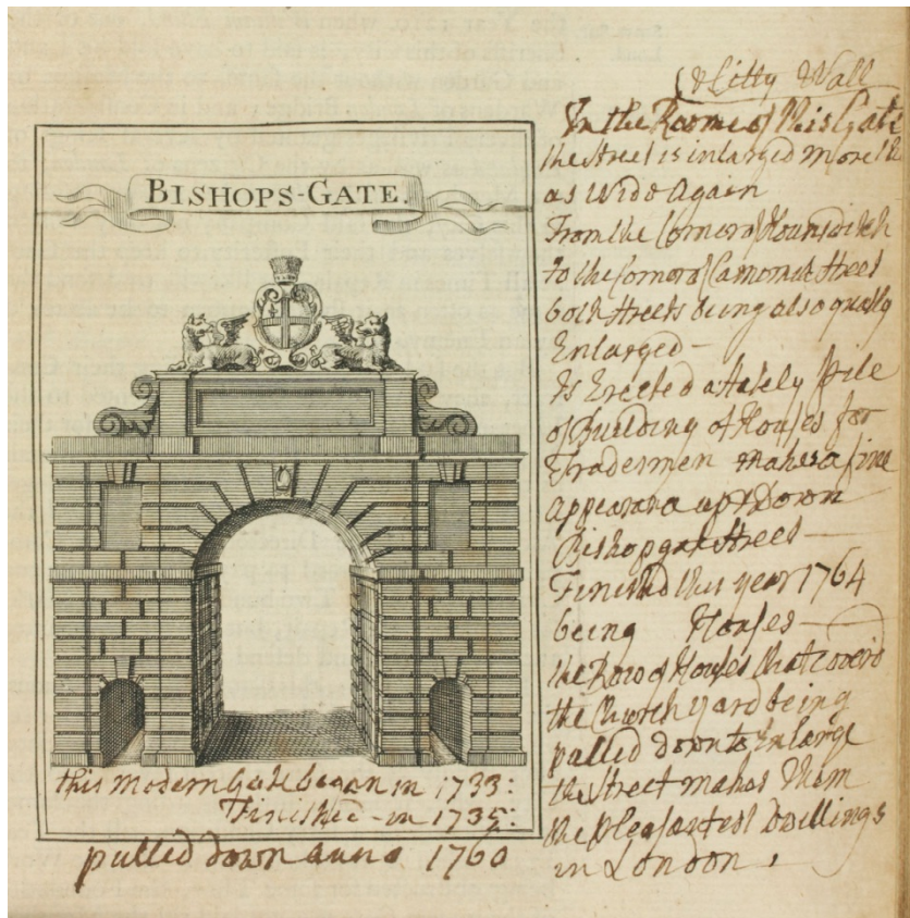
“Bishops-Gate.” Annotated illustration on p. 15, in Peter Collinson’s copy of William Maitland, History of London (London, 1739).