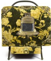
Photograph album with stand, ca. 1908. Michael Zinman Binding Fund.

Also included are various materials and ephemera, including prints, photographs, broadsides, and advertisements. Books help us remember the past, record the present, and imagine the future. The Living Book will inspire you to think about how we use books in our daily life, and the value of its preservation for discovery and exploration in the future.