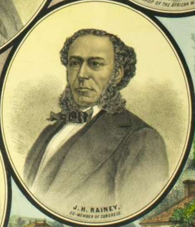
J. H. RAINEY, EX-MEMBER OF CONGRESS