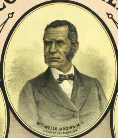
WM. WELLS BROWN, M. D., AUTHOR OF 'THE RISING SON'