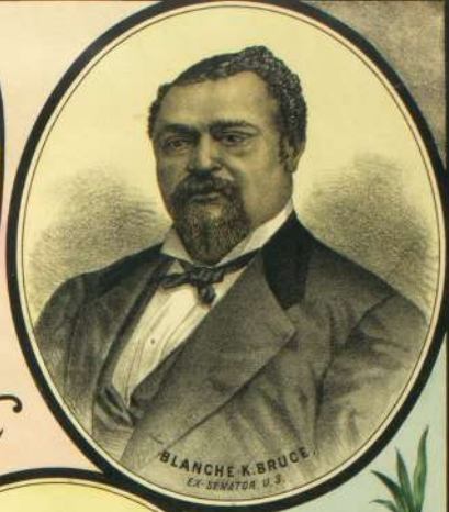
BLANCHE K. BRUCE, EX-SENATOR U. S.