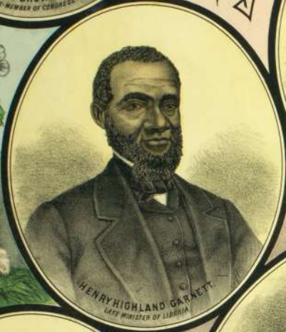
HENRY HIGHLAND GARNETT, LATE MINISTER OF LIBERIA