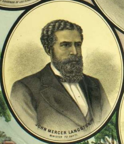
JOHN MERCER LANGSTON, MINISTER TO HAITI