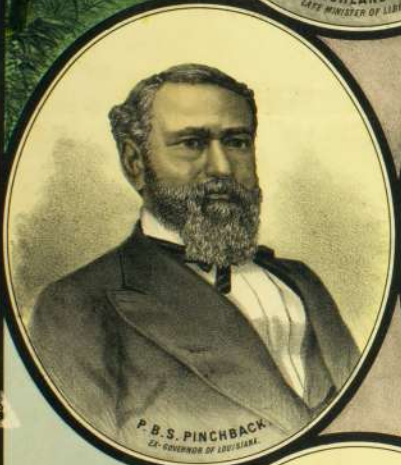
P. B. S. PINCHBACK, EX-GOVERNOR OF LOUISIANA