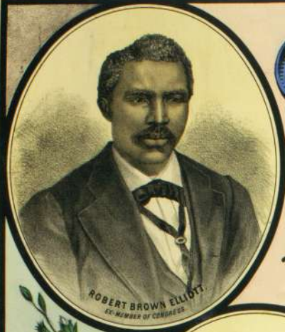
ROBERT BROWN ELLIOTT, EX-MEMBER OF CONGRESS