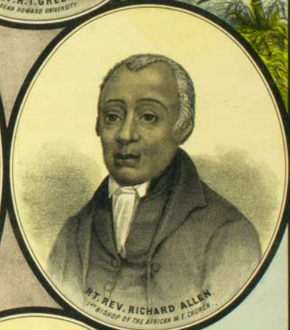
RT. REV. RICHARD ALLEN, BISHOP OF THE AFRICAN M. E. CHURCH