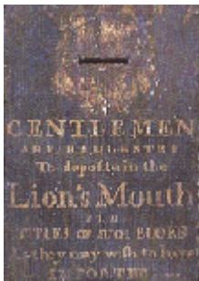
Tin Suggestion Box, ca. 1750

On July 1, 1731, Benjamin Franklin and a number of his fellow members of the Junto drew up "Articles of Agreement" to found a library. The Junto was a discussion group of young men seeking social, economic, intellectual, and political advancement. When they foundered on a point of fact, they needed a printed authority to settle the divergence of opinion. In colonial Pennsylvania at the time there were not many books. Standard English reference works were expensive and difficult to obtain. Franklin and his friends were mostly mechanics of moderate means. None alone could have afforded a representative library, nor, indeed, many imported books. By pooling their resources in pragmatic Franklinian fashion, they could. The contribution of each created the book capital of all.