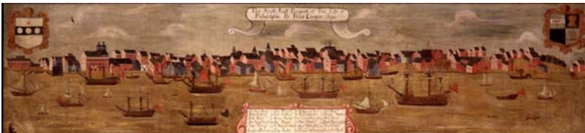
Peter Cooper, The Southeast Prospect of the City of Philadelphia . Oil on canvas, ca.1720. Gift of George Mifflin Dallas. Th earliest painting of a North American city, found in a London Curiosity Shop in 1857.

One of the Library Company's treasures came to it in 1857 as a gift from George Mifflin Dallas, then American minister at the Court of St. James. "One of the members of Parliament in looking over the rubbish of a City curiosity shop" brought him a